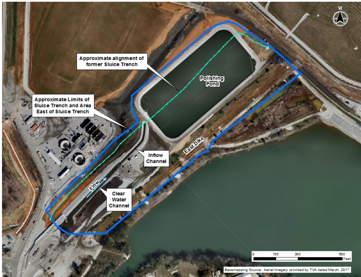
Figure 1 Site Overview

Much of the Sluice Trench and Area East of Sluice Trench containing CCRs has been closed by regrading the ash and constructing cover systems. The cover systems beneath the polishing pond and water quality/inflow channels include geosynthetic materials. The area west of the water quality/inflow channel was covered with two feet of soil. Current planning calls for the area between the polishing pond/water quality/inflow channel and the East Dike to be covered in 2018.