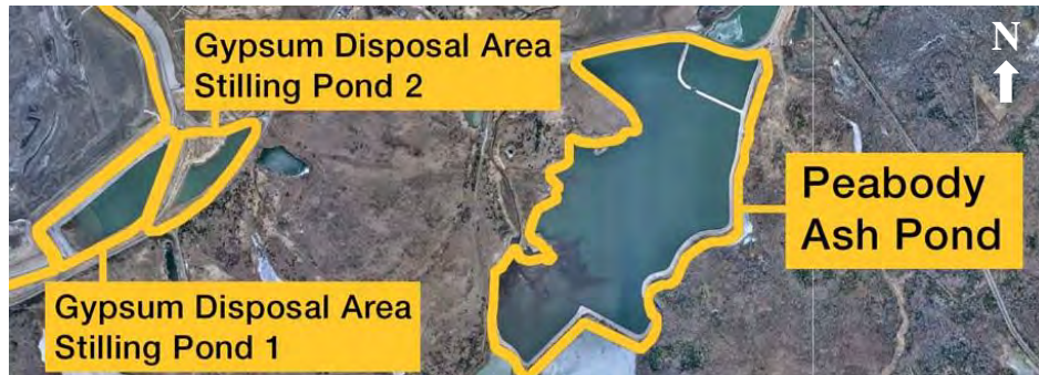
Figure 1: Site Overview

Tennessee Valley Authority (TVA) owns and operates the Paradise Fossil Plant (PAF) in Drakesboro, Kentucky. The plant is located along the southwestern side of the Green River along State Route 176. The Peabody Ash Pond is an active Coal Combustion Residual (CCR) impoundment that manages process water flow and CCR waste during power generation. Peabody Ash Pond is located in the southeast corner of the Paradise Facility. The pond currently serves as a waste water treatment and fly ash pond. An internal divider dike separates the main pond from the stilling pond located on the north end of the impoundment.