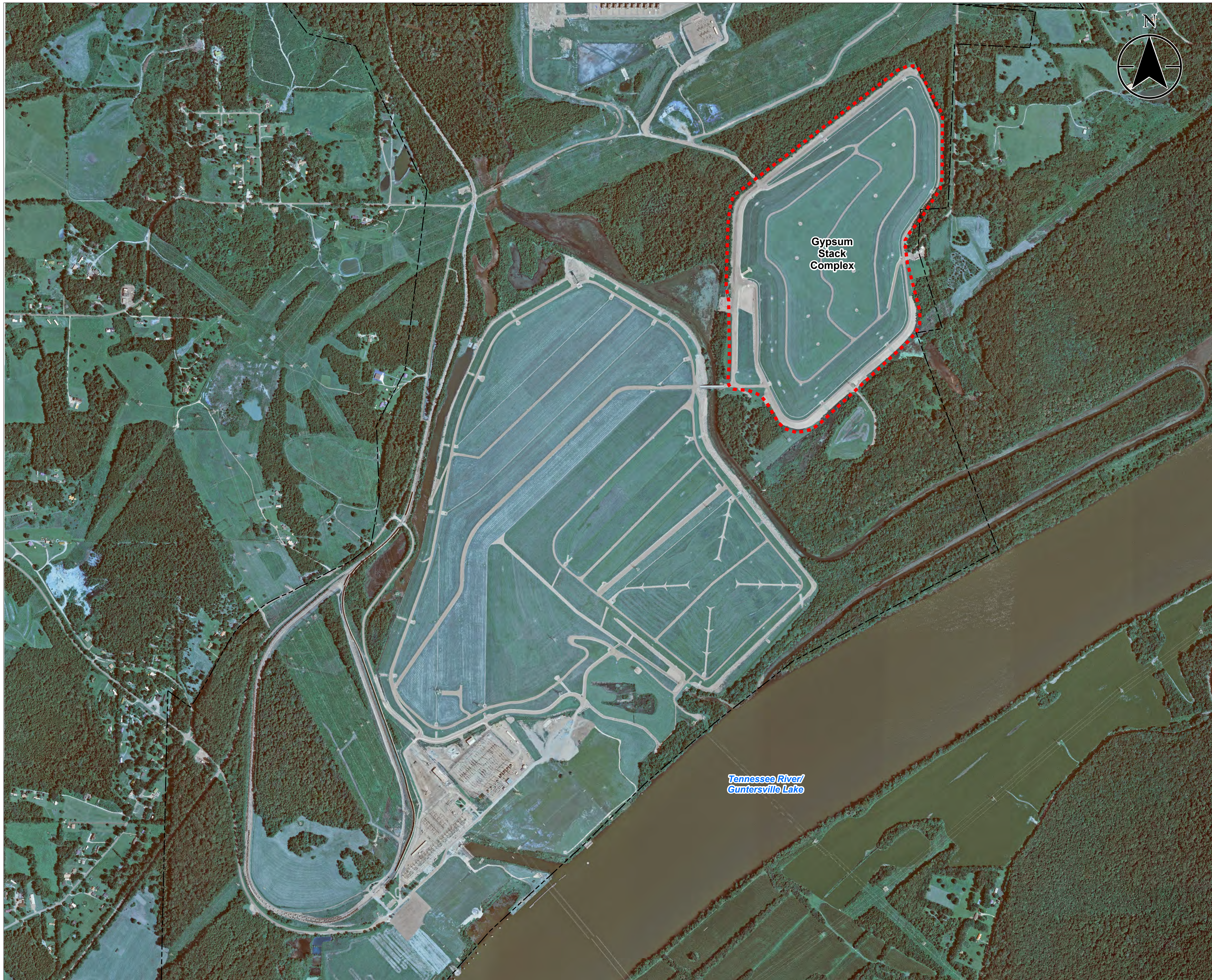
Exhibit No. 1 Title Widows Creek Fossil Plant Site Map

Client/Project Tennessee Valley Authority Widows Creek Fossil (WCF) Plant